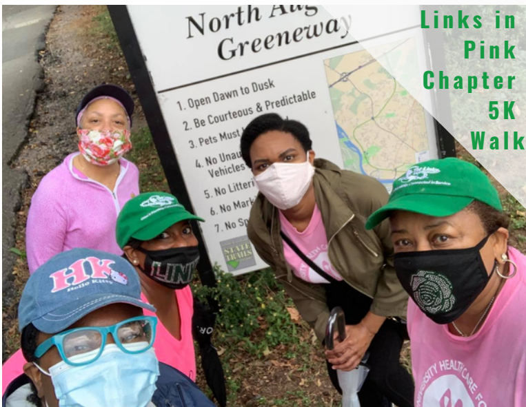
Links in Pink Chapter 5K Walk