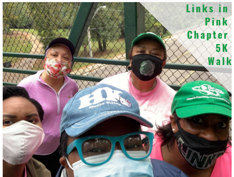
Links in Pink Chapter 5K Walk