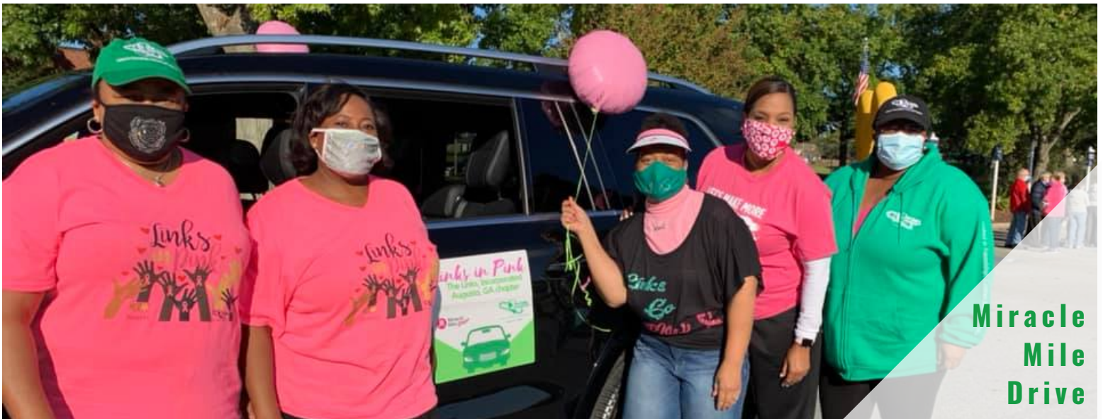
Miracle Mile Drive